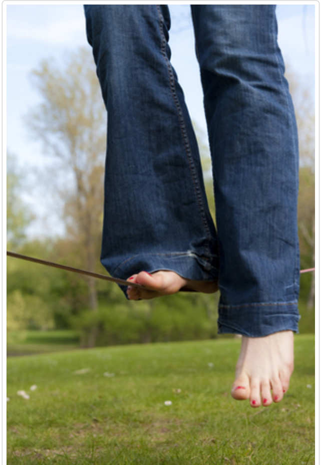
PRIDE-HD was originally planned to assess whether pridopidine improved movement function in HD.

The trial was called PRIDE-HD . It was originally planned to run for 6 months, and included higher doses of pridopidine than used in HART and MermaiHD, in hopes that higher doses of drug may provide greater benefit